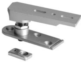
End load arm shown

*Note that mounting channels must be welded into frames prior to shipment to job site.