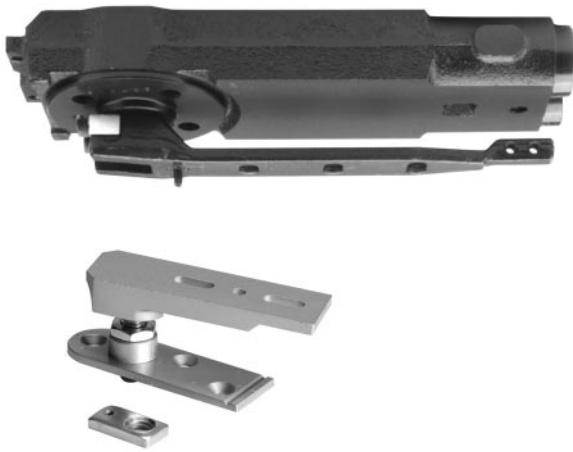
End load arm shown

*Note that mounting channels must be welded into frames prior to shipment to job site.